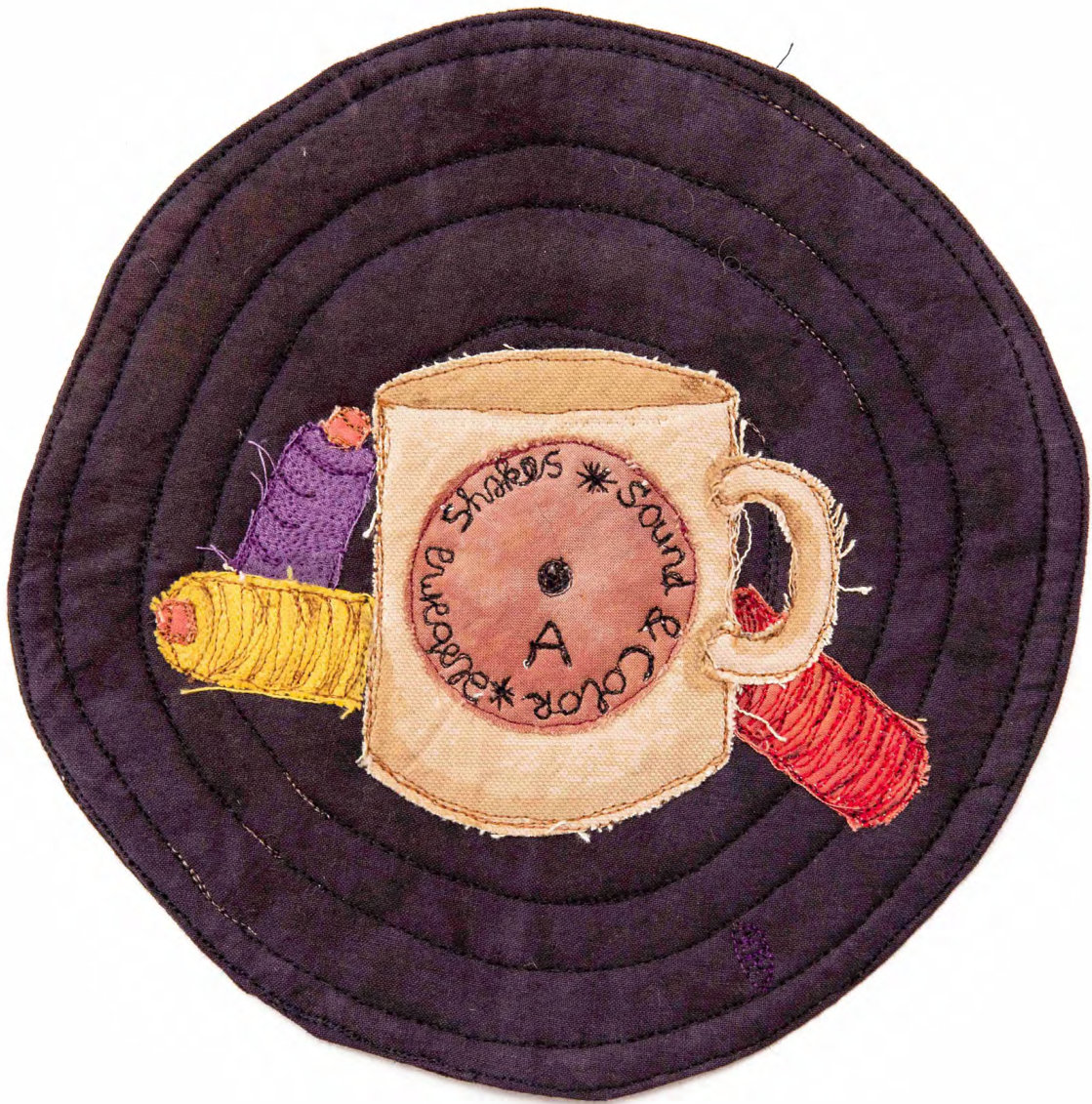
Sound & Colour wall - hanging free machine embroidery on hand dyed cotton stained with hand made nature dye $180