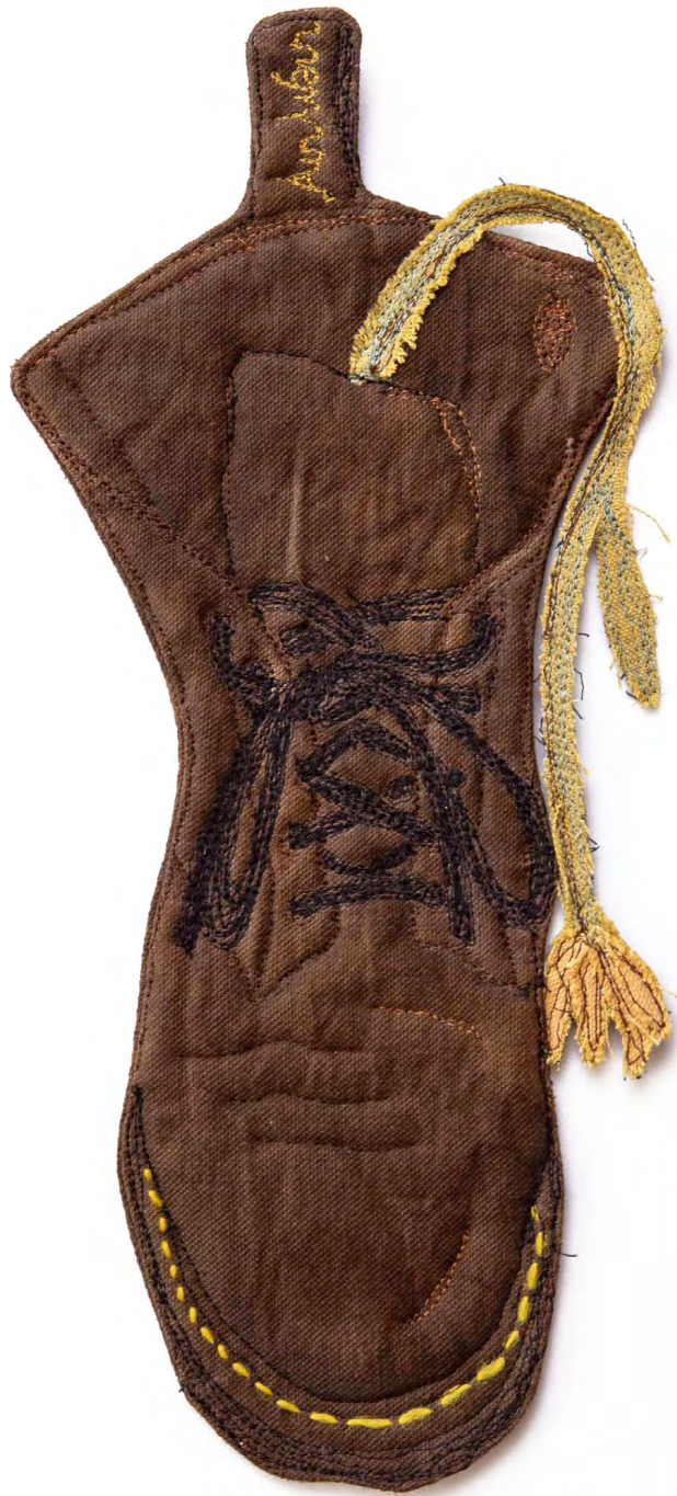
Tired and Worn wall - hanging free machine embroidery on hand dyed cotton stained with nature dye. $180