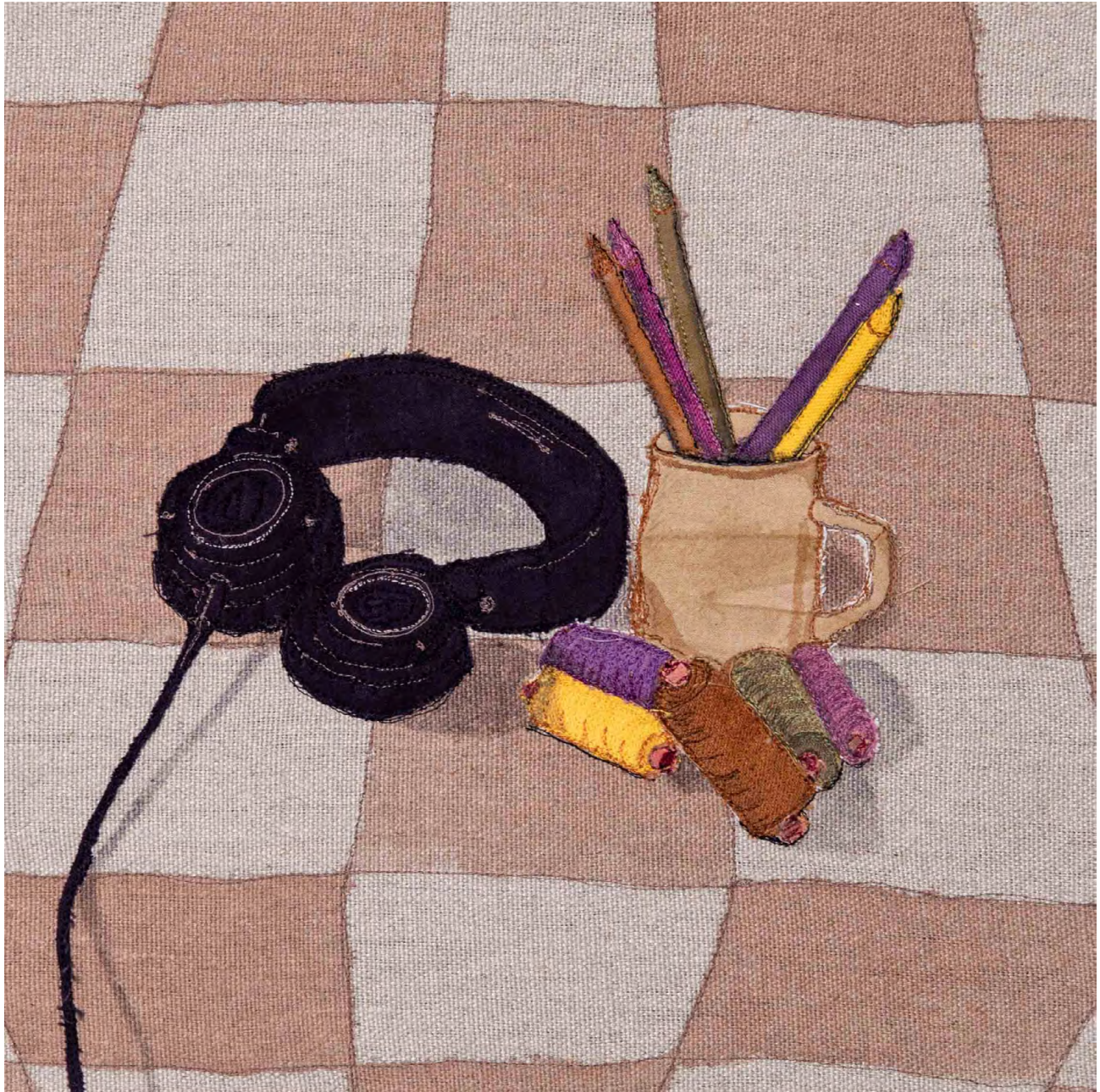
'Sound & Color' (2025) Inspired by: Alabama Shakes - Sound & Color 30cm x 30cm free machine embroidery, reclaimed canvas, nature dye $425

OPENING: Fri 18 July 6-8pm DATES: 17 - 31 July 2025