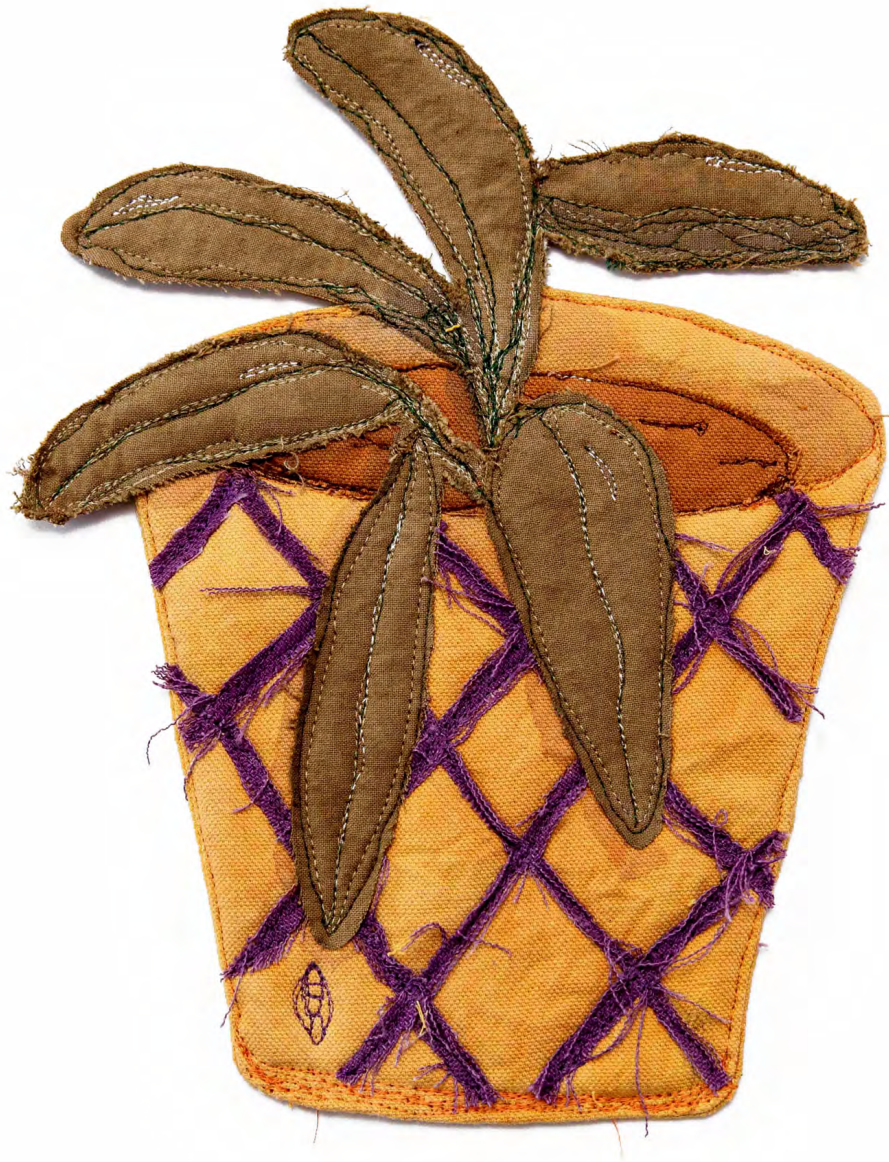
Empty Chairs wall - hanging free machine embroidery on hand dyed cotton stained with nature dye. $180