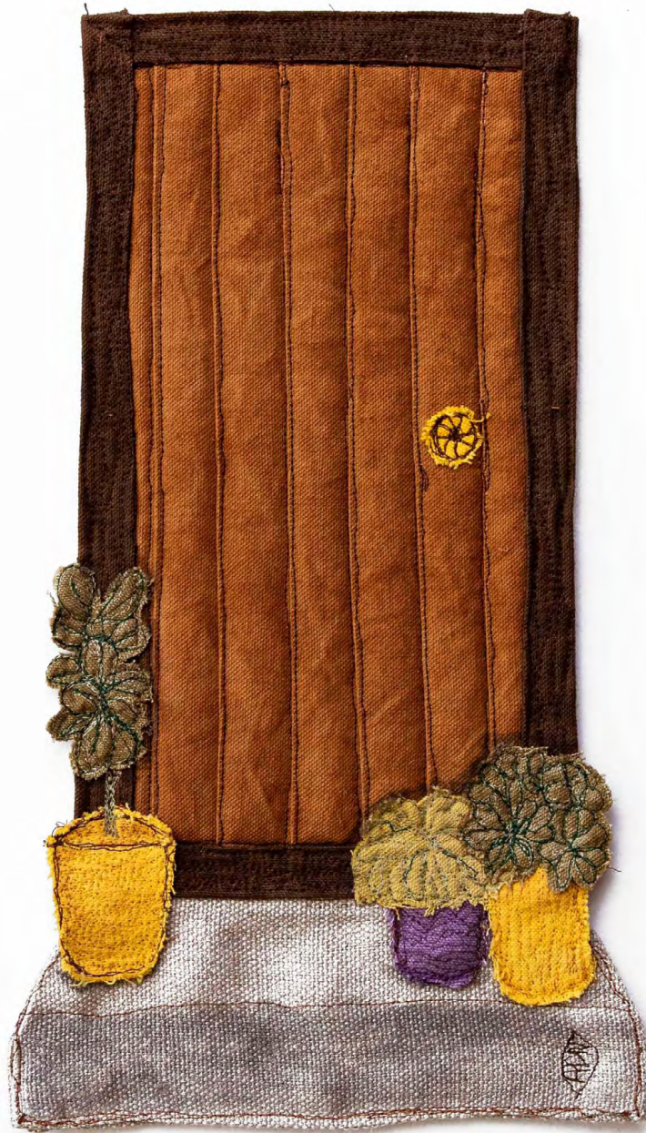
Like a Door wall - hanging free machine embroidery on hand dyed cotton stained with hand made inks $180