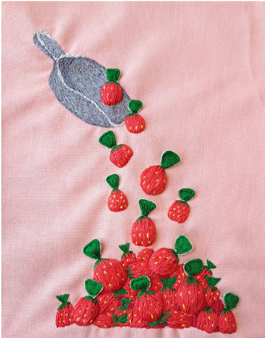
To the Bottom of the Lolly Jar by Julia Catania Cotton thread hand-embroidered on cotton blend, wool roving, paper-wrapped wire framed 25 x 20cm $400 SOLD