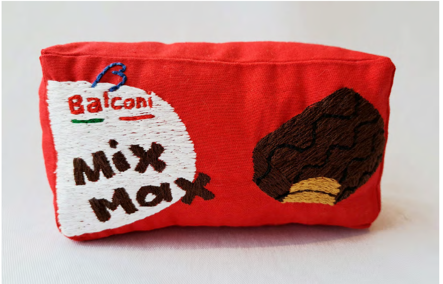
Nonna's Pantry Staple II by Julia Catania Cotton thread hand-embroidered on cotton, polyfill 9.5 x 16 x 6cm $300