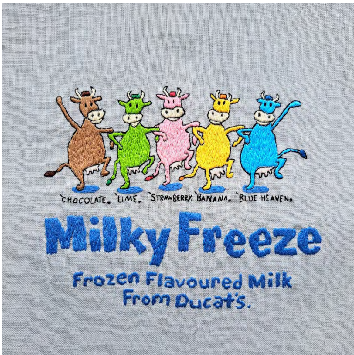
Canteen Classic by Julia Catania Cotton thread hand-embroidered on linen, framed 19.5 x 19.5cm $400 SOLD