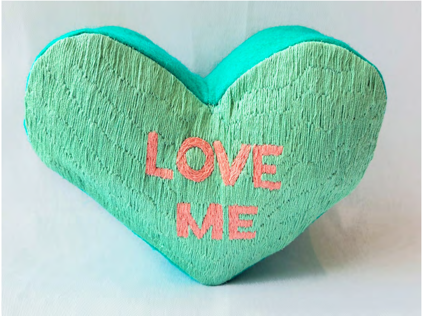
Love Me by Julia Catania Cotton thread hand-embroidered on linen, wool felt, polyfill 16 x 21 x 9cm $380