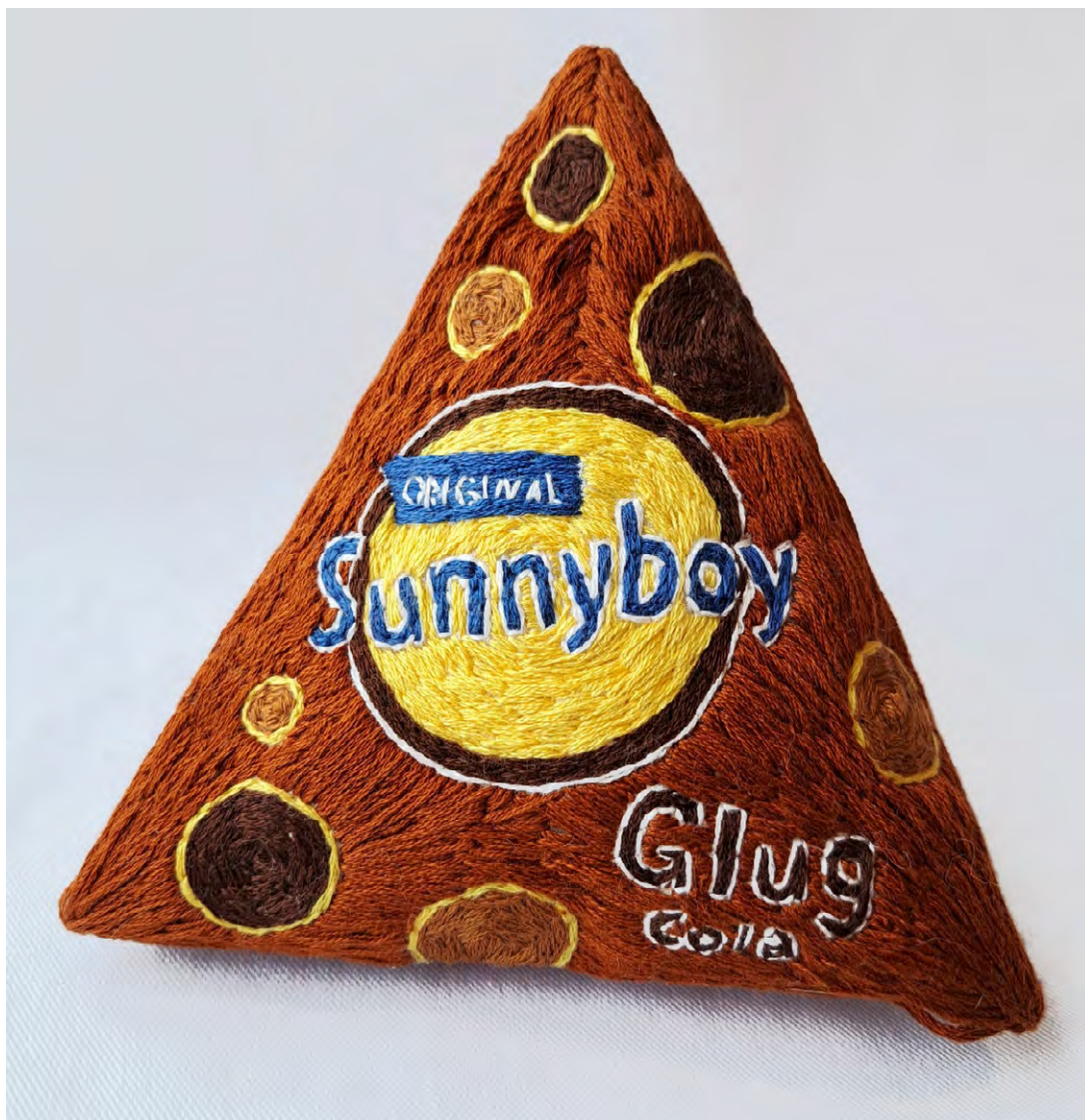
The Best Flavour by Julia Catania Cotton thread hand-embroidered on calico, polyfill, acrylic gouache 12.5 x 14 x 16cm $460