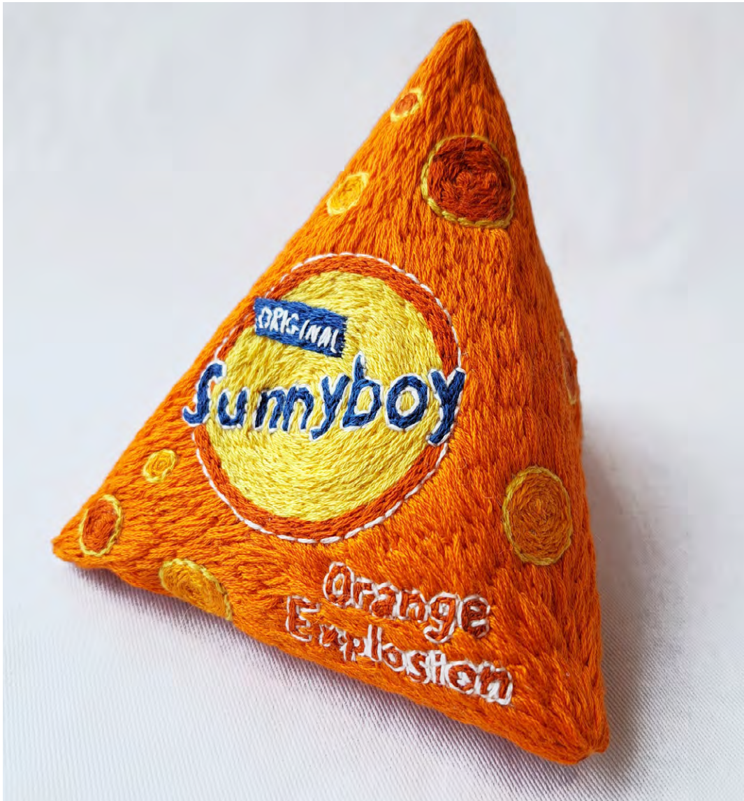
Definitely Third by Julia Catania Cotton thread hand-embroidered on calico, polyfill, acrylic gouache 11 x 12 x 15cm $460