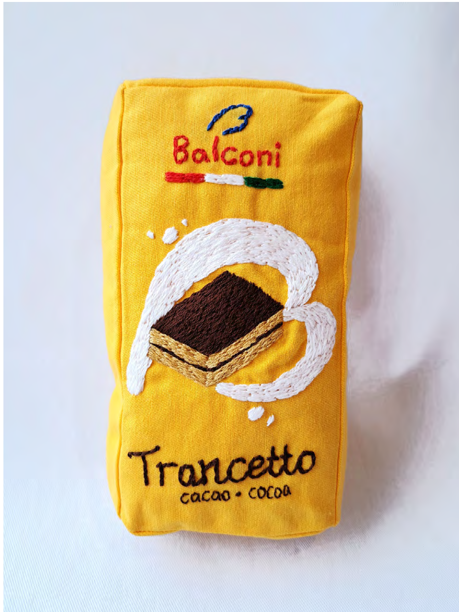
Nonna's Pantry Staple I by Julia Catania Cotton thread hand-embroidered on cotton, polyfill 18 x 10 x 7cm $300