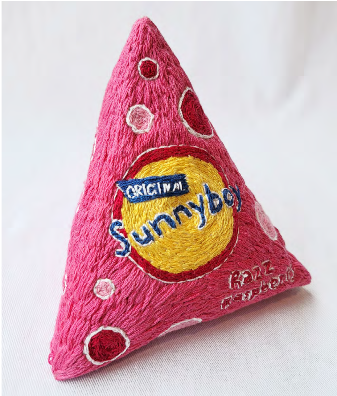
A Close Second by Julia Catania Cotton thread hand-embroidered on calico, polyfill, acrylic gouache 12.5 x 13 x 16cm $460