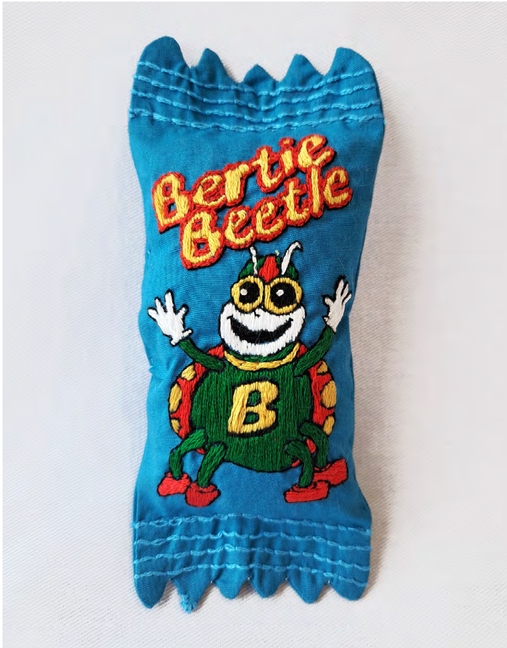
The Showbag Exclusive by Julia Catania Cotton thread hand-embroidered on cotton, polyfill 15 x 6.5 x 3cm $200 SOLD