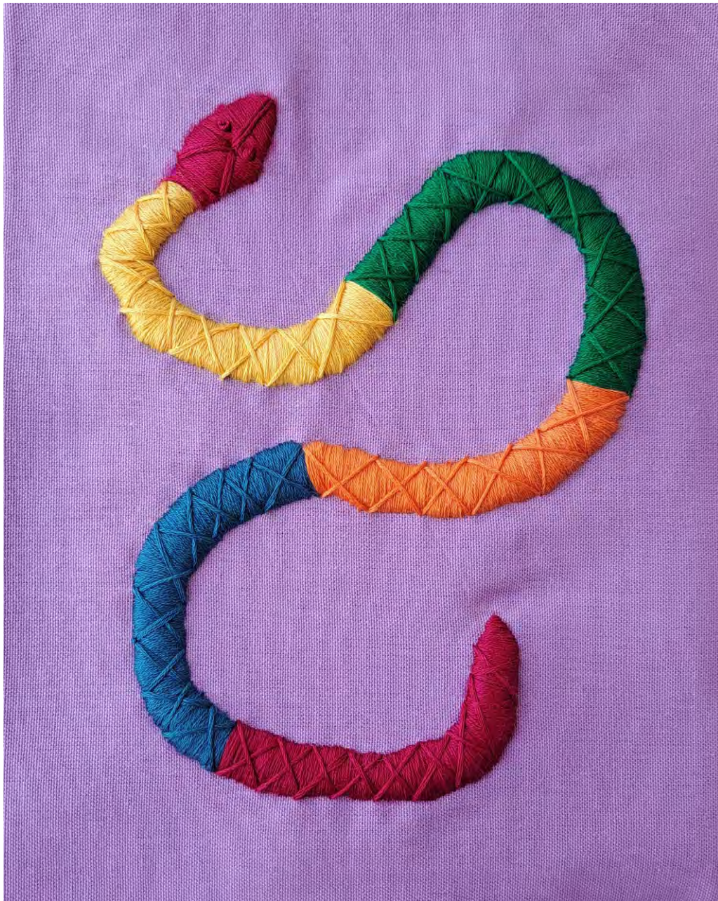
I Used to be Value for Money by Julia Catania Cotton thread hand-embroidered on linen blend, wool roving, framed 24.5 x 19.5cm $300