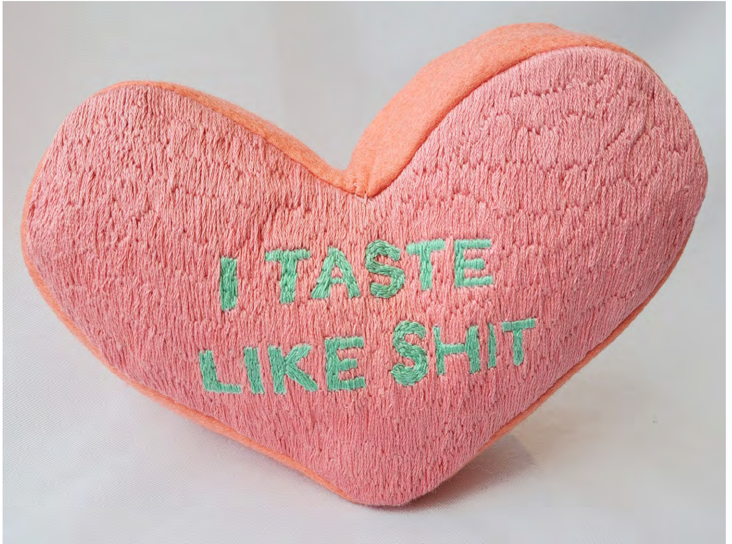
I Taste Like Shit by Julia Catania Cotton thread hand-embroidered on cotton blend, wool felt, polyfill 15 x 22 x 9cm $380