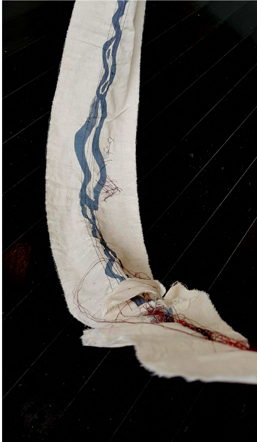
thinkaboutthisthinkaboutthisthinkaboutthis vol.2 (detail) by Sarah Catania Lino print and thread on hand dyed fabric Dimensions variable $1200