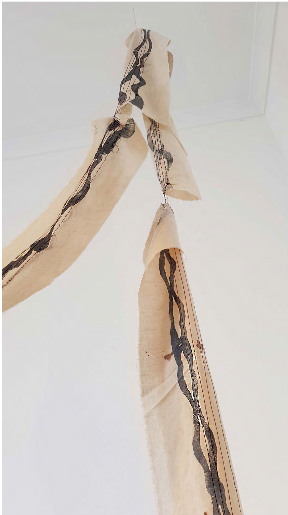
thinkaboutthisthinkaboutthisthinkaboutthis vol.2 (detail) by Sarah Catania Lino print and thread on hand dyed fabric Dimensions variable $1200