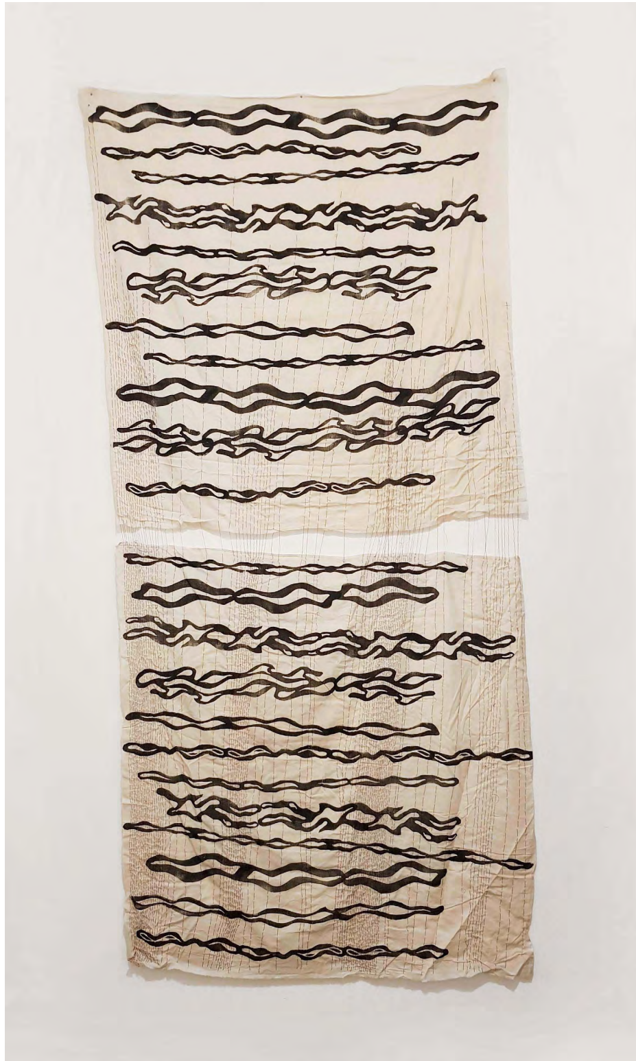
thinkaboutthis thinkaboutthis thinkaboutthis vol.1 by Sarah Catania Lino print and thread on hand dyed fabric 105cm x 220 cm $1000