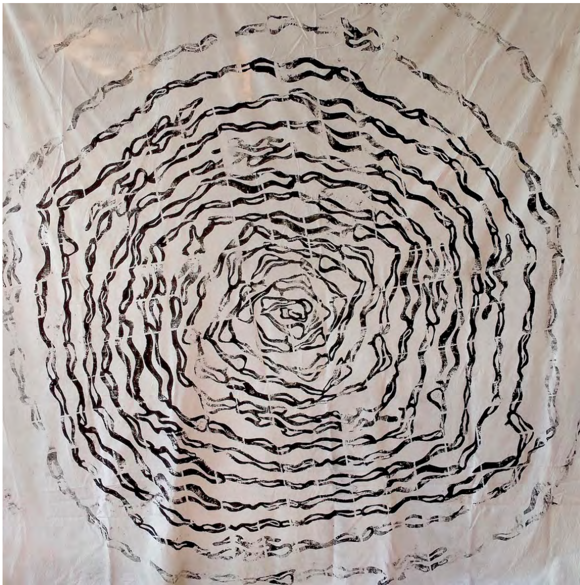
Untitled (detail) by Sarah Catania Lino prints on hand dyed fabric Dimensions variable $800