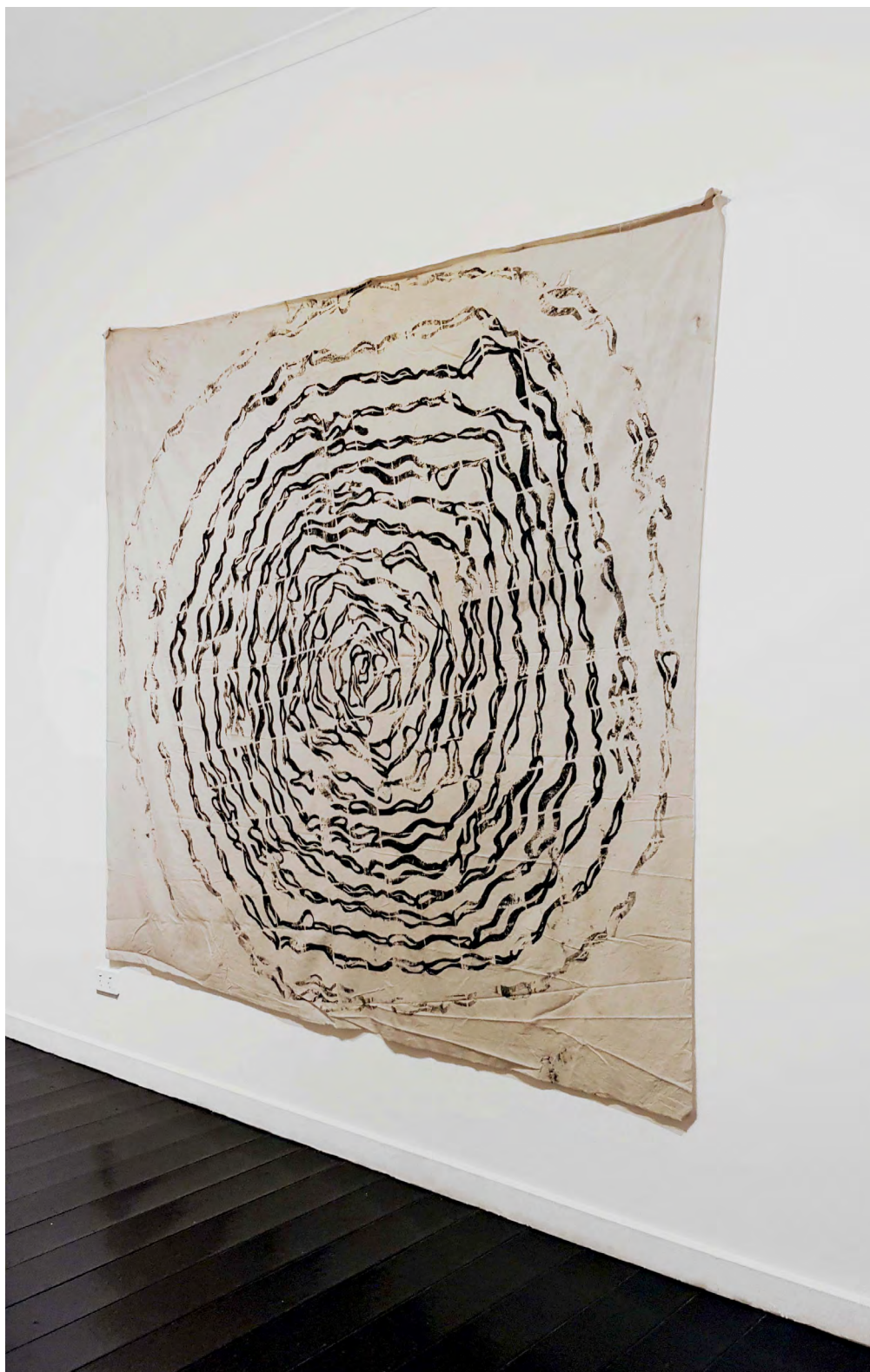
Untitled (installation view) by Sarah Catania Lino prints on hand dyed fabric Dimensions variable $800